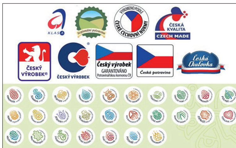
Figure 2 | Labels with reference to Czech origin

Figure 2 shows the research sample of labels that refer to Czech origin. The results of the analyses are summarised in the order of the individual labels in Figure 2. The labels were examined according to the conditions for the COO in the rules for branding and the use of the labels. Table 3 then synthesises the defined conditions that are associated with the COO branding and use criterion.